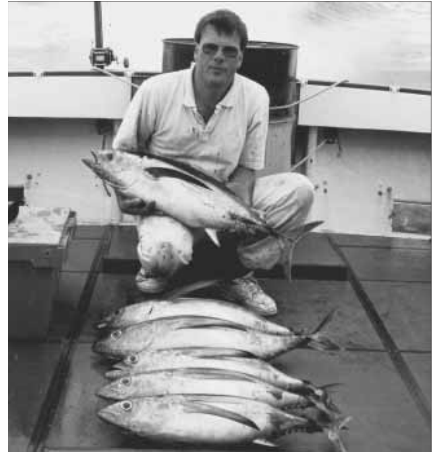
The journey home with six tuna ranging from 12 to 25 lbs in weight

Although blue fin are listed on the Irish Specimen Fish Committee's marine list, the other species like tuna, sailfish and swordfish are not. Who will be the first angler to set up a new class?