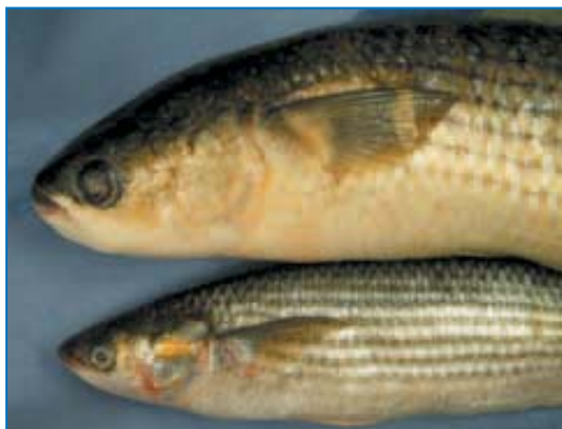
Grey Mullet (top) and Golden Grey Mullet comparison; note arrow-like head shape, smaller lip size, longer pectoral fin length and golden spot on gill cover in the Golden Grey Mullet.