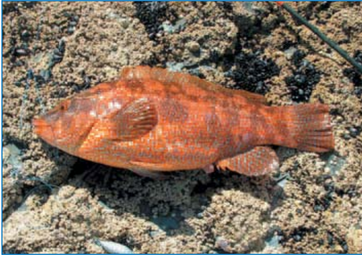
Ballan Wrasse of 5 lbs taken in 2002 by the 'ordinary angler'