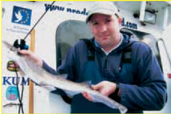
Black Mouthed Dogfish from Red Bay in 2005