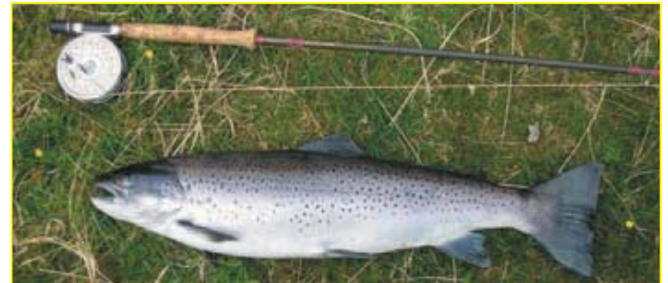
Arthur White's specimen Sea Trout – Lough Currane – 2005